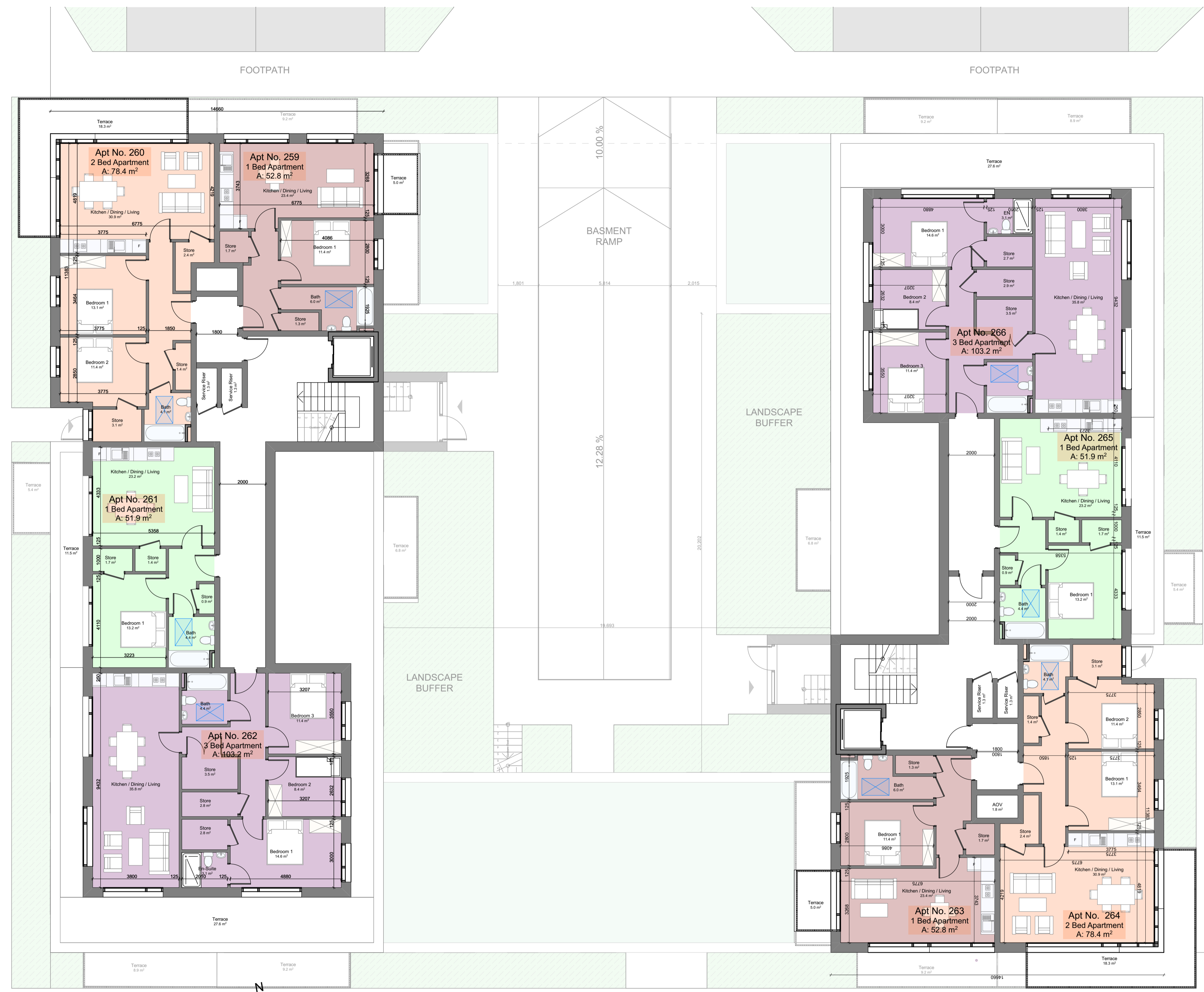
FOURTH FLOOR PLAN Scale 1: 100