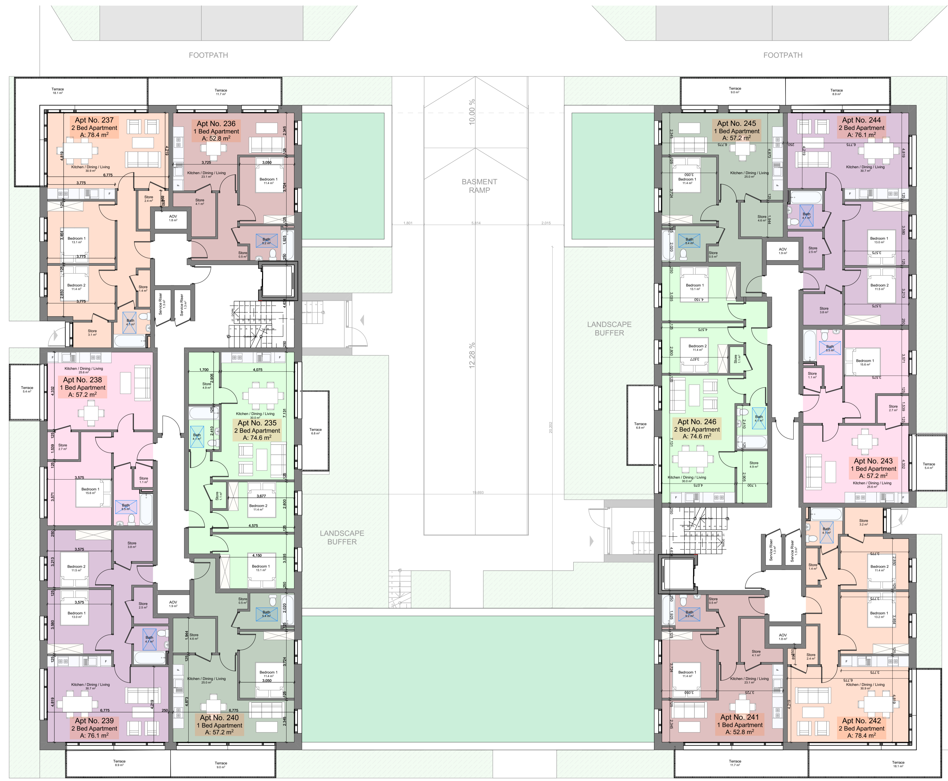
SECOND FLOOR PLAN Scale 1: 100