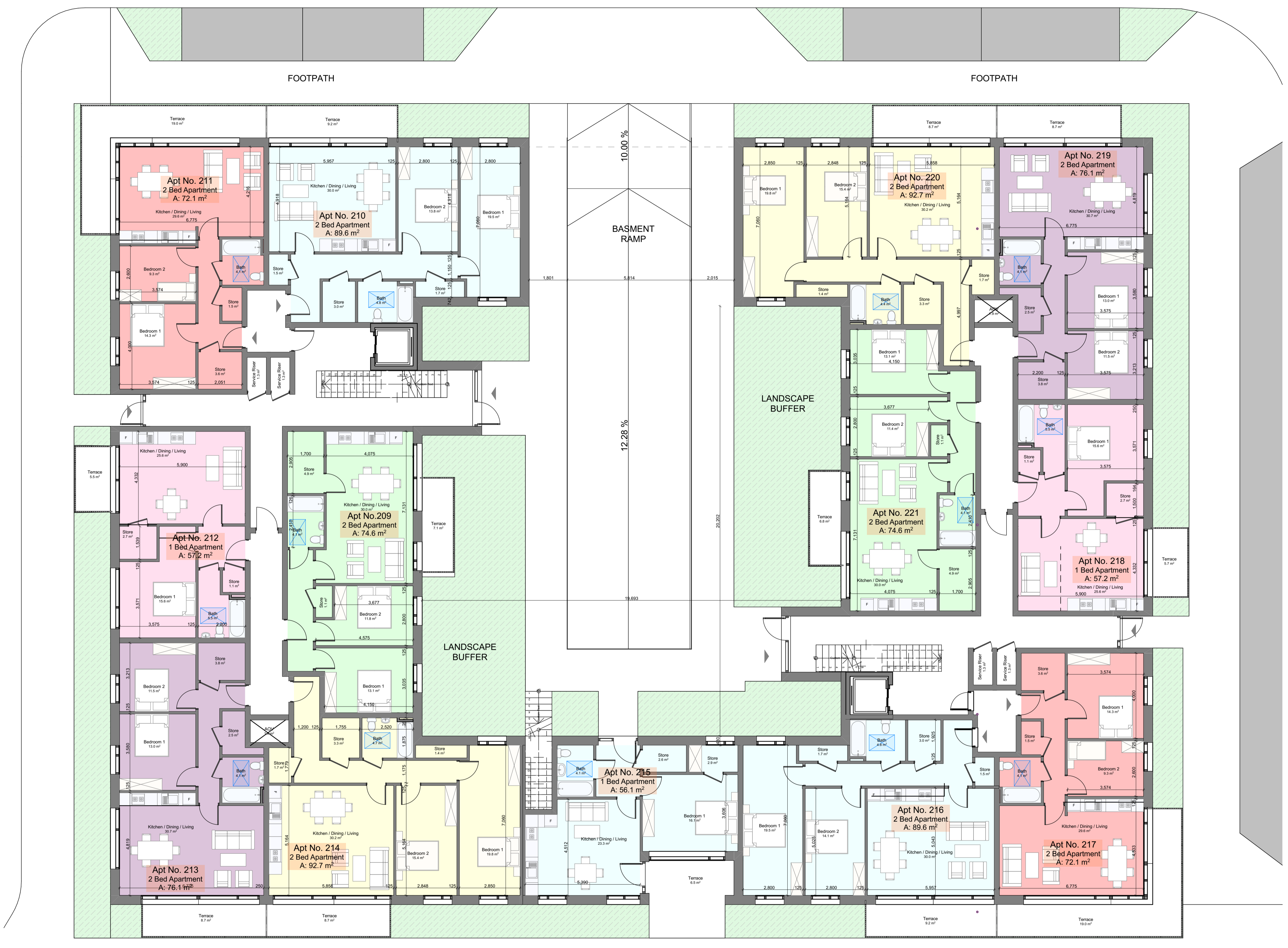
GROUND FLOOR PLAN Scale 1: 100