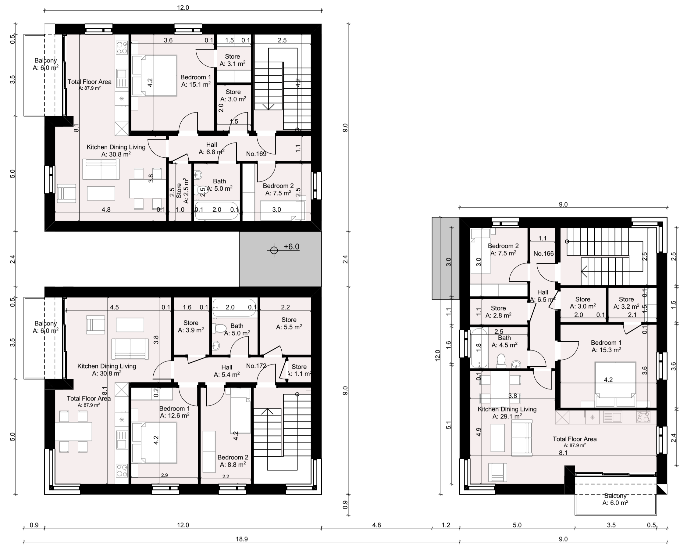
Second Floor Plan SCALE 1:100