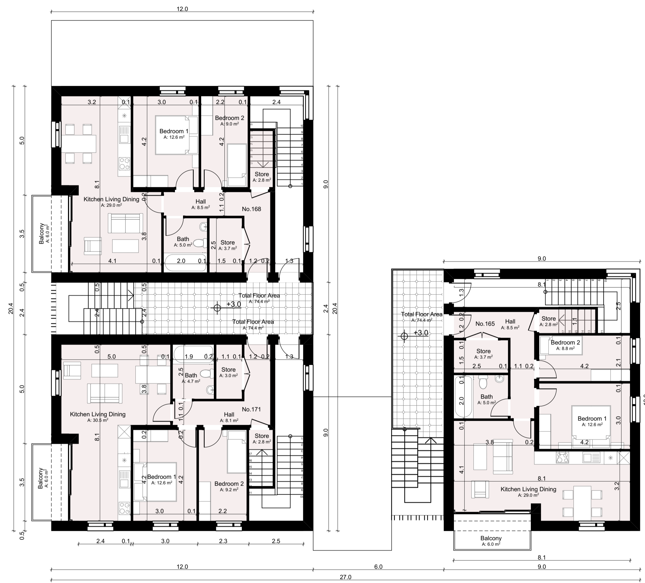
First Floor Plan SCALE 1:100