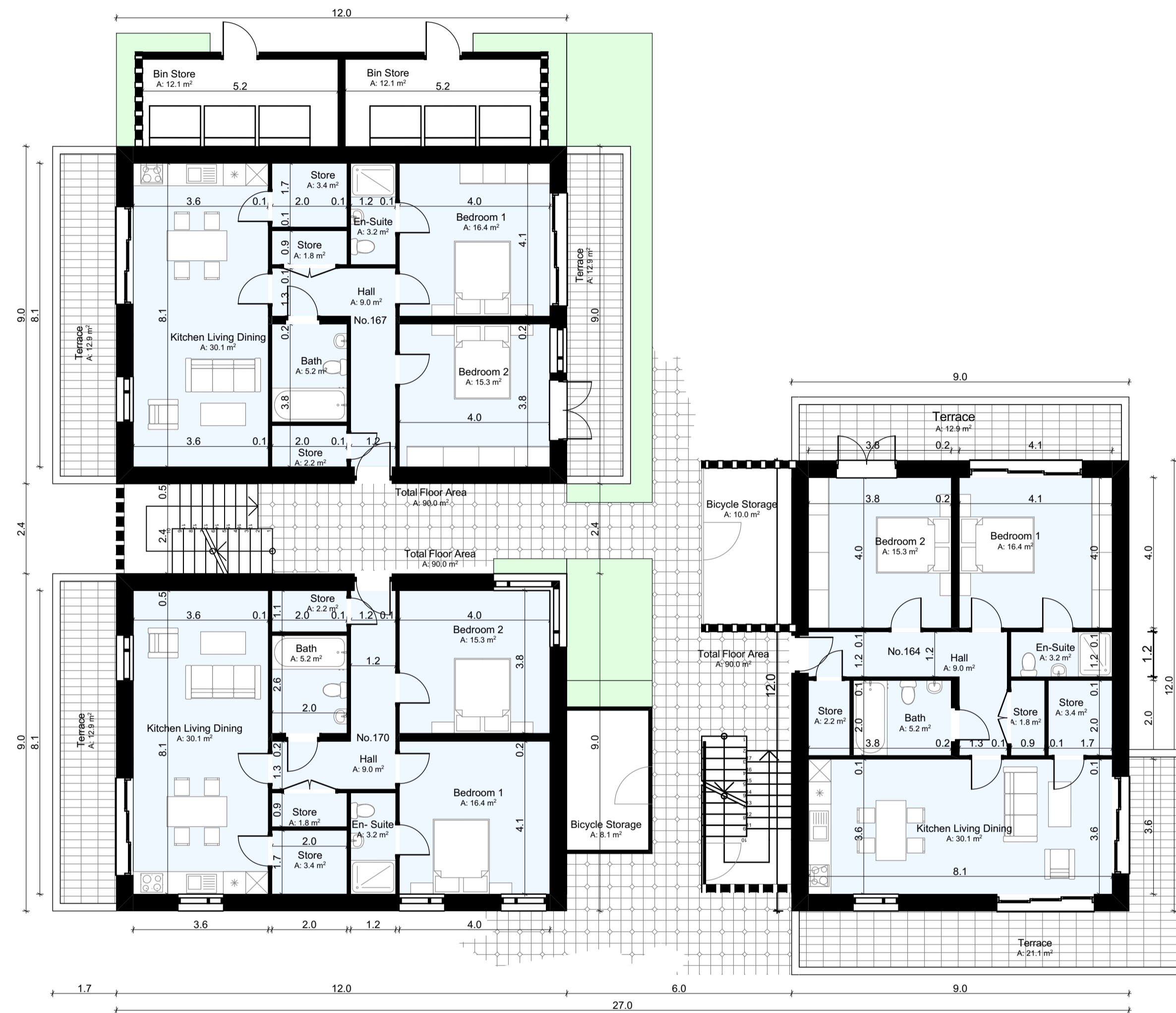
Ground Floor Plan SCALE 1:100

This drawing is for planning purposes only and not for construction. This drawing or design may not be reproduced without permission.